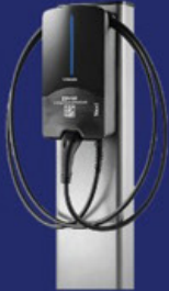
ESYGO WEBASTO Next Series