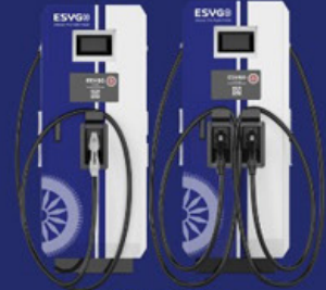
ESYGO Xpress DC Chargers 28/30/60/120/300 kW