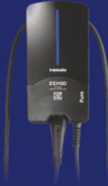
ESYGO WEBASTO Pure Series