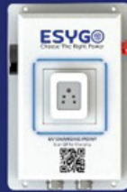
ESYGO COMPACT 3.3 kW